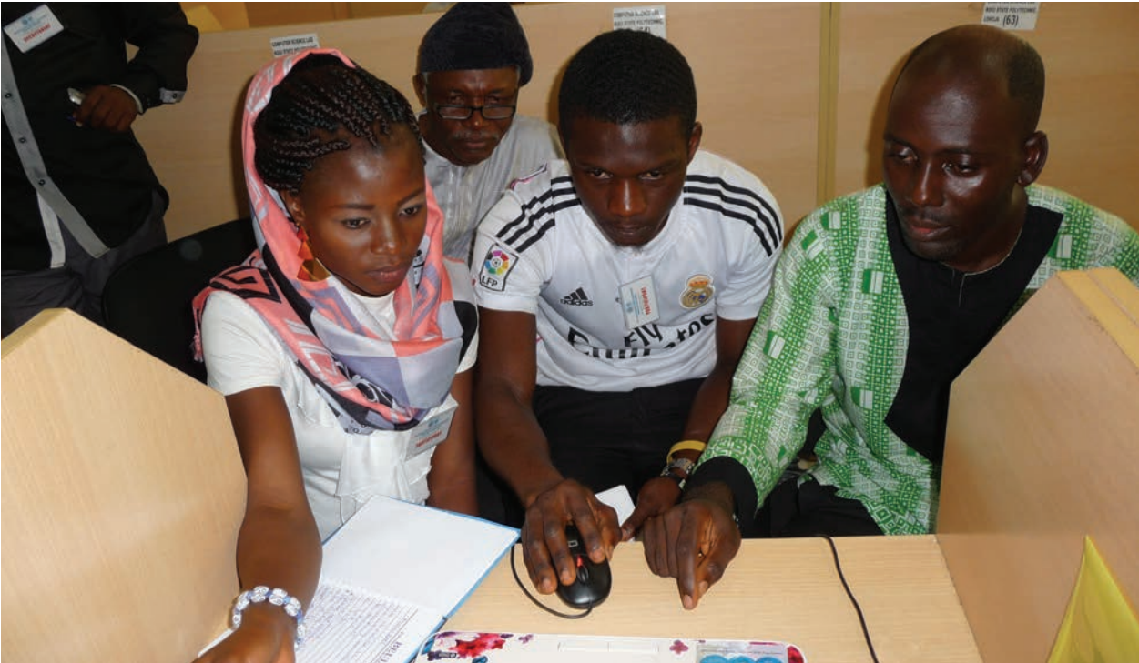
Learning Minecraft in Lokoja, Nigeria