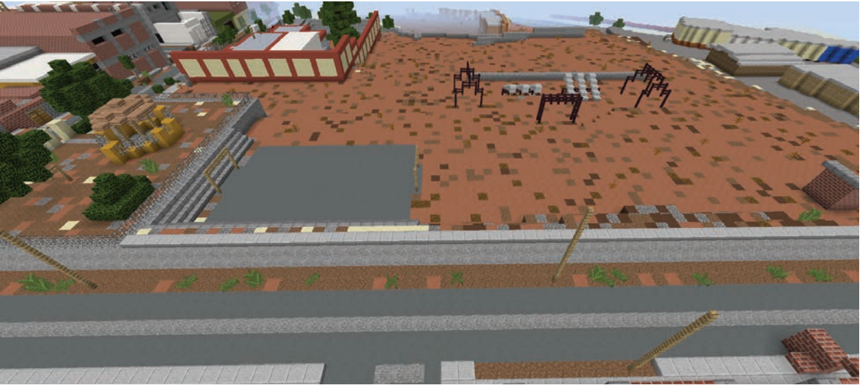
Park in Lima, Peru before participatory Minecraft workshop