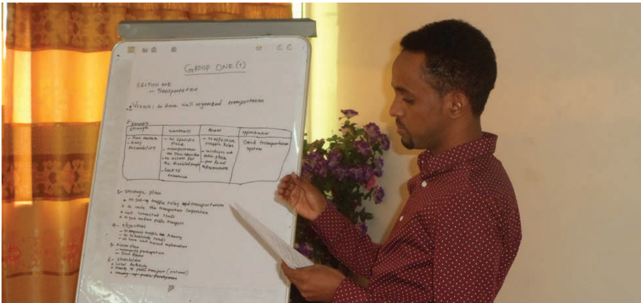
Group presentation in Hargeisa, Somaliland

The groups then present their lists and discuss similarities and differences. The training facilitators play a key role in managing the discussion, dealing with potential conflicts and validating different issues that are brought up during this session. Once the presentations are done, the facilitators display each of the groups' lists in the training venue so that the participants can consult them while building their models in Minecraft. If there is time, the participants may also take a short tour of the site to better understand the issues related to this discussion session.