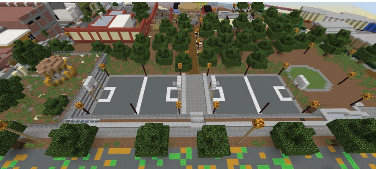
Park in Lima Peru, showing improvements in Minecraft