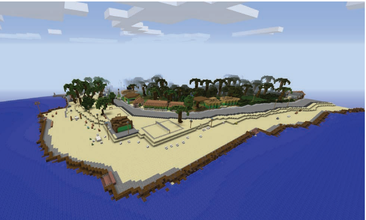
Plage la Touterelle, Haiti, redesigned in Minecraft

The gameplay of Minecraft is perhaps best imagined as a complex 'digital Lego'. The creative and building aspects of Minecraft allow players to build structures out of textured cubes in a three-dimensional generated world. Creative mode enables gamers to easily create buildings similar to those produced by complex 3D modelling software, with the additional benefit of being able to construct structures together through the multiplayer setting. As a result, the building process is more similar to real-life construction projects with multiple workers carrying out different roles simultaneously, than traditional digital 3D model-making with only one designer.