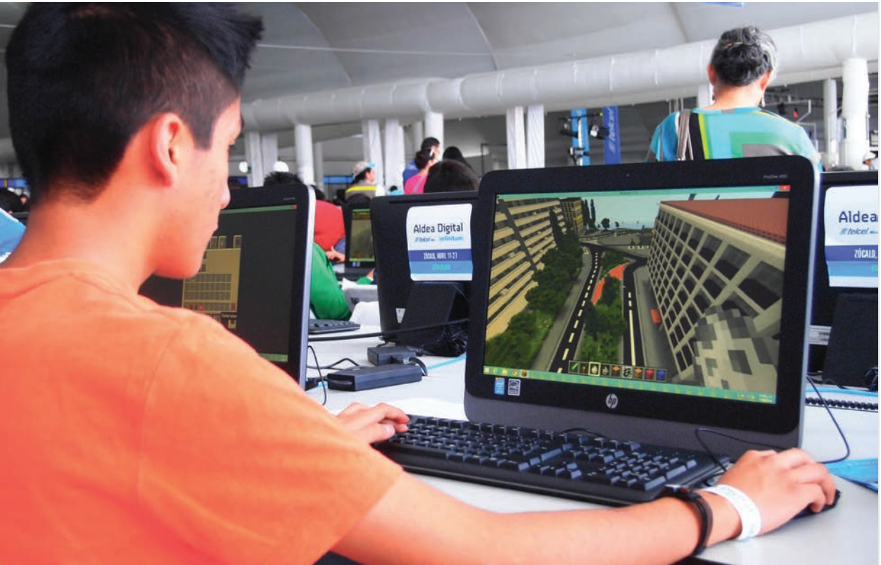
A participant redesigning a public square in Mexico City