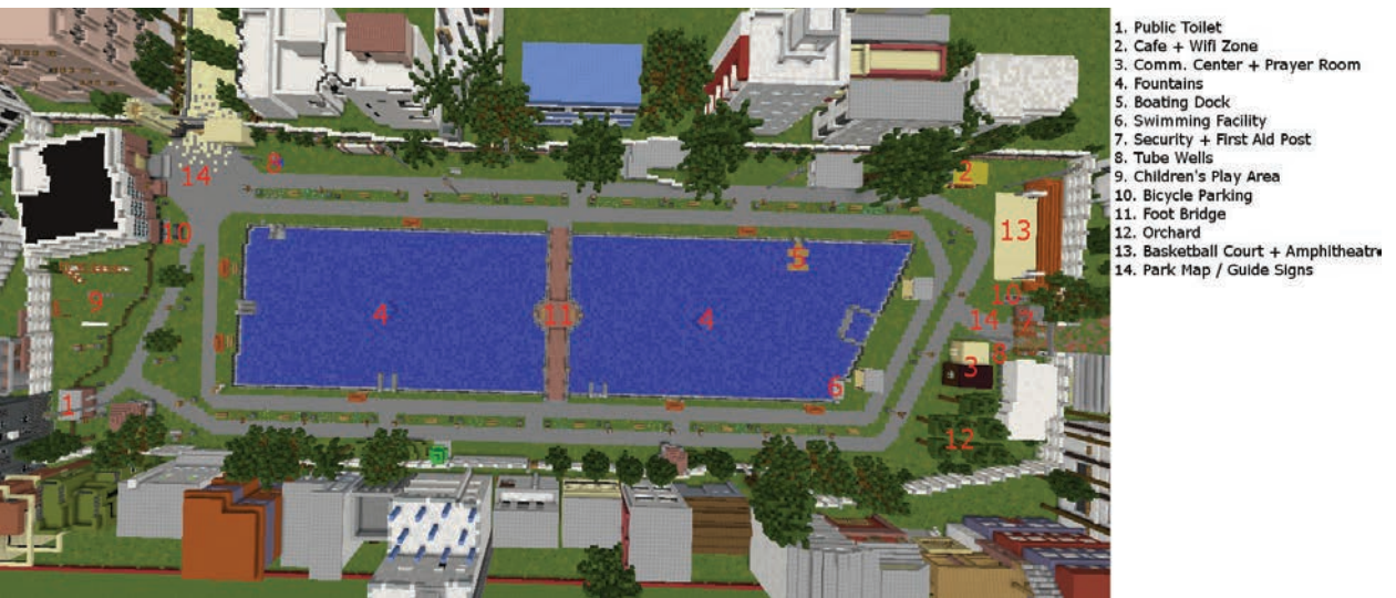
Final consolidated model of Solar Park, Khulna, Bangladesh