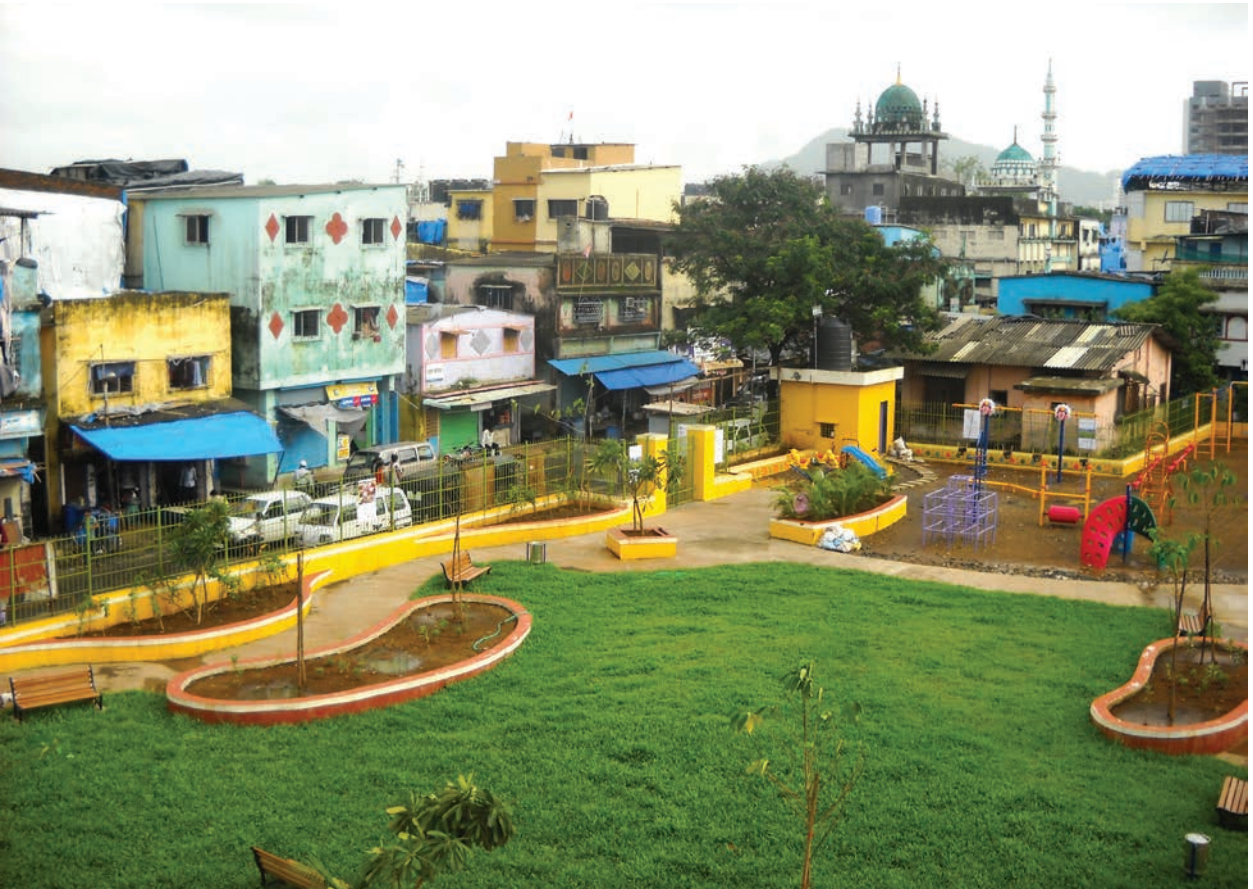
A completed public space in Mumbai, India